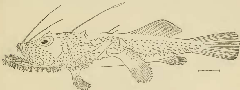
FIG. 1.—LOPHIODES OLIVACEUS. (FROM THE TYPE.)

Dorsal spines plain bristles, excepting the third, which is scantily fringed; first 1.80 in head, its base close to receding edge of lip; second 2.23, close to first; third 1.34, longest, partly concealed at its proximal end, its base being in vertical to posterior margin of eye; fourth 4.37, slender, concealed for nearly a third of its length, its base midway between tip of snout and base of caudal; fifth 5.90, similar to fourth and close to it; dorsal rays subequal, except first